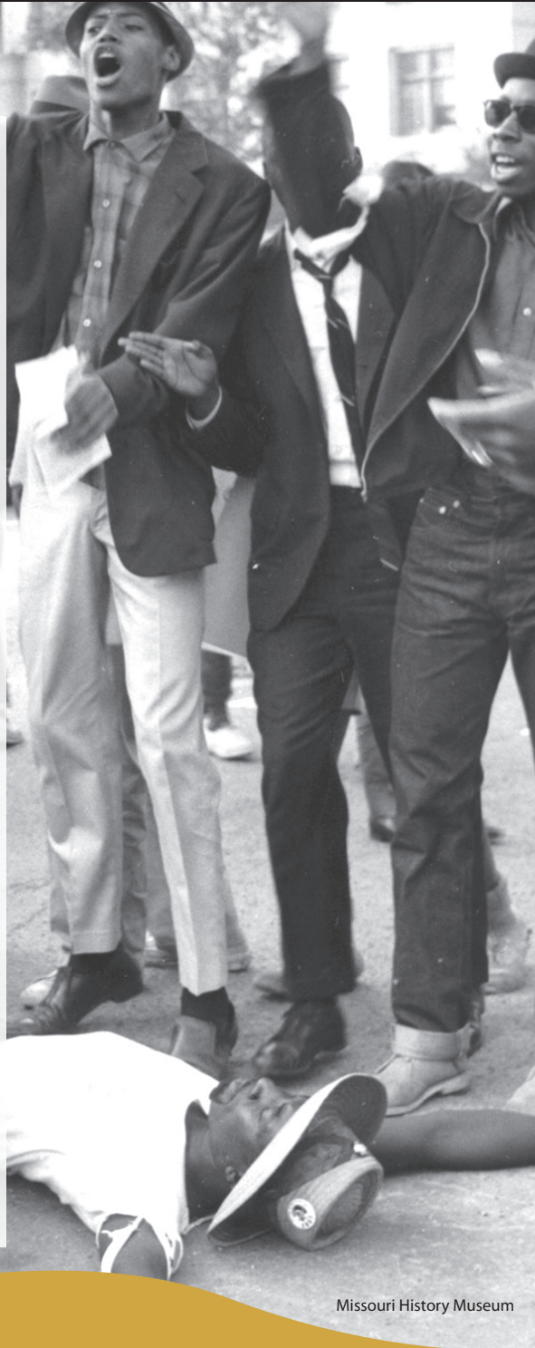
Missouri History Museum

The Bridge will bring together the voices and perspectives of past and current St. Louis civil rights leaders to reveal how organizing and activism have evolved throughout history into present moments of social unrest, political transition, and heightened consciousness. Bridging themes within the #1 in Civil Rights exhibition, this interactive conversation will inspire audience participation as it evokes reflections of past movements in the city, insights from current moments, and lessons that inform future efforts in the struggle for civil rights.